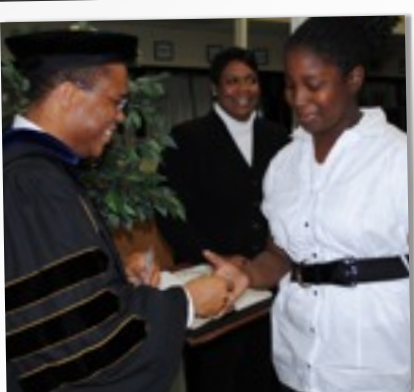
NATIONAL JUNIOR HONOR SOCIETY

Students leave Nims as well-rounded, confident young adults with talents in core subjects, performing arts, fine arts, sports, visual design, robotic engineering, and beyond!