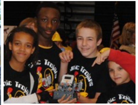
ROBOTICS CLUB AFTER WINNING ANOTHER COMPETITION